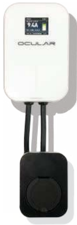
Model: OC20-BA-7.2KW OC20-BA-22KW