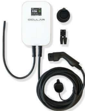
Model: OC20-BC-7.2KW OC20-BC-22KW